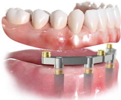
Fixed-removable restoration on four implants and a bridge