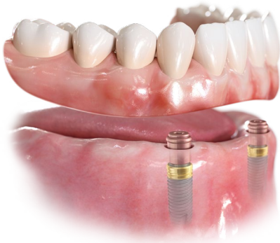
Fixed-removable restoration on two implants