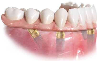
Fixed restoration on four implants, the All-on-4® treatment concept